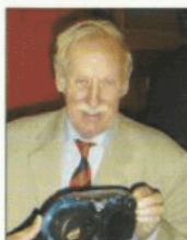
The Altran Prize launch. Trevor Bayliss with his famous clockwork radio. Professor Bayliss invented the "wind up radio" which requires no batteries and is improving lives in many third world countries.

Altran is an international innovation technology company and has become a market leader. In 1996 it created an educational foundation to encourage an interest in science and technology amongst young people. Altran approached WLF to help launch this year's project. This is another exciting milestone in the work of WLF.