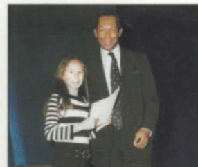
Lord Taylor launches the 2003 World Citizen Project at Westminster City School with one of the star pupils.