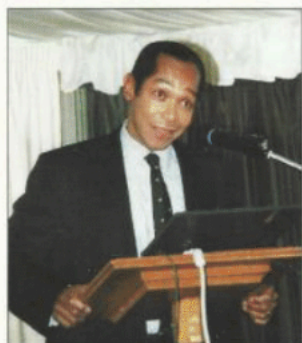
Lord Taylor of Warwick

"Strive to be not only the best in the world, but the best for the world."