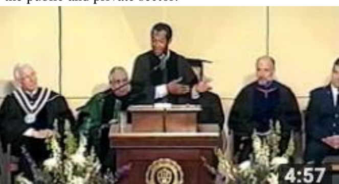
Keynote Speaker at Graduation Ceremony USA