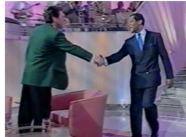
Alan Titchmarsh BBC 1