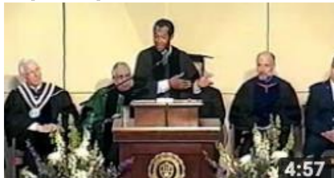
Keynote Speaker at Graduation Ceremony USA