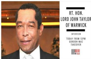
THE SOUL BARON RADIO FM