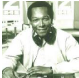
BBC RADIO 2